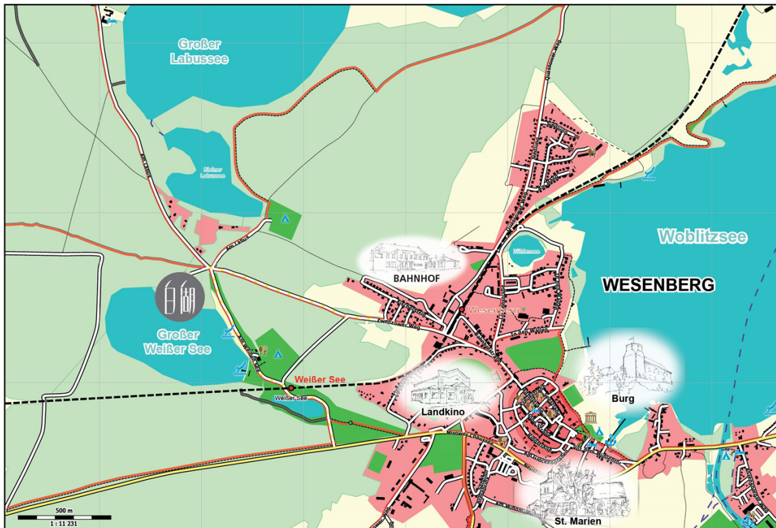
Map - TOWN OF WESENBERG